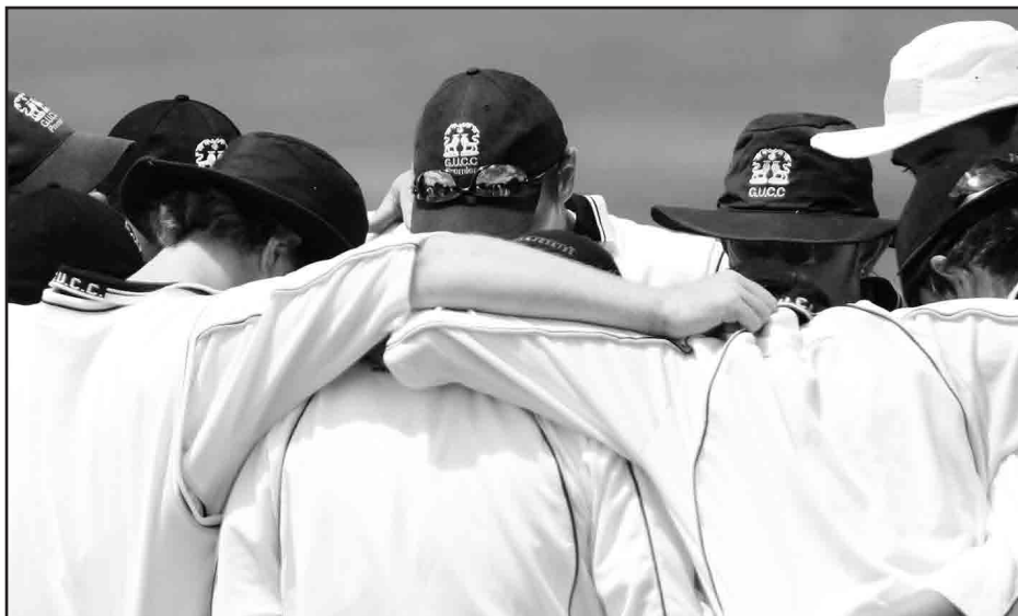
The Grafton side gets together for a team talk

"I really wanted to give something back to Grafton. When we started it